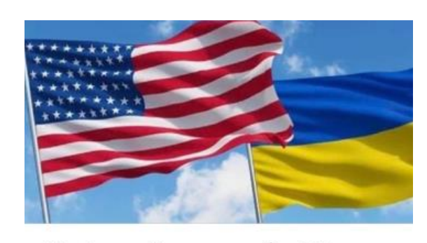
Help refugees in St. Louis!